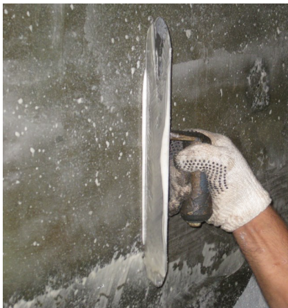
Bughole filling with RestoKrete® 209

RestoKrete® Epoxy Mortar 208 is a substrate repair material and waterproofing barrier for the prevention of inflow and infiltration in concrete or brick substrates. As an epoxy-based mortar, it is used specifically for resurfacing applications requiring a heavier material thickness with tenacious bonding properties. The 208 is specifically recommended as the underlayment for those acid environments where a cementitious material is difficult to use. 208 is applied by spray equipment or hand-applied by trowel and it is designed to be compatible with Sauereisen's epoxy and urethane topcoats.