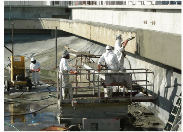
RestoKrete® F-121 applied by shotcrete