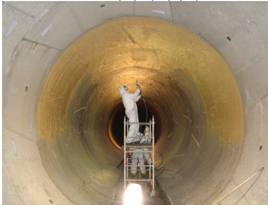
SewerGard® 210S applied in a tunnel

In sewage treatment plants, Sauereisen products protect the surfaces of wet wells, headworks, aeration basins, digesters, grit chambers, sedimentation tanks, clarifiers and any other structure that comes in contact with the wastewater stream. Sauereisen products are also used in chemical containment, secondary containment and process areas.