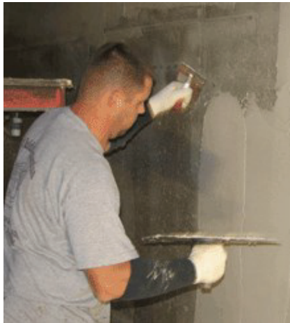
RestoKrete® 208 applied by trowel