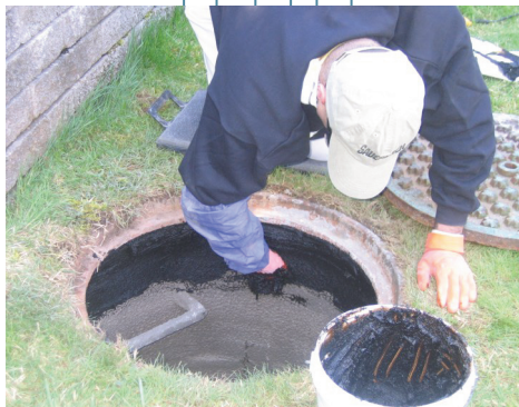
Application of F-88 ChimneySeal™