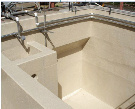
SewerGard® 210X applied in a digester

Sauereisen's diversity of knowledge in both cementitious and organic polymers lends itself to understanding the properties required for those products used in concrete surface restoration. Consequently, we offer products to enable a return of structural integrity that are formulated for compatibility with our SewerGard® corrosion resistant epoxy lining materials. Sauereisen's engineered systems are key to a successful installation, providing maximum service life.