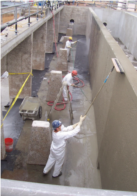
H2OPruf™ F-190 applied with brush finish

Manhole ChimneySeal™ F-88 is an elastomeric lining composed of fiber-reinforced, asphalt-modified urethane. It is applied by hand to the chimney sections of manholes to prevent water inflow. As a high solids elastomeric, ChimneySeal™ maintains excellent elasticity and adhesion over a temperature range of -30°F to 250°F. It accommodates the environmental stresses and thermal movement of nearly all climates common to manhole chimneys or risers constructed with brick and mortar or concrete segments.