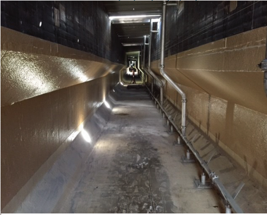
SewerGard® 210S in an influent channel

Likewise, our expertise in concrete and substrate repair has served our customers well in addressing the problems of water inflow and infiltration (I&I). To prevent the costly effects of I&I, Sauereisen offers cementitious and epoxy materials for spot repairs and full surface rehabilitation and sealing.